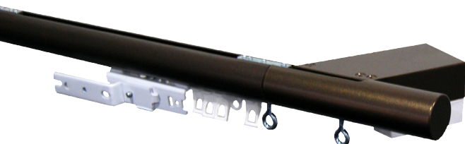
81 Antique Bronze Deventer MRS Rail with finished end pulley.