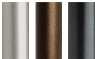
29 Satin Nickel